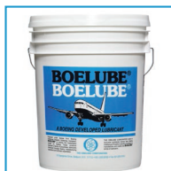
70090-05 (5 gal - 18.9 l)