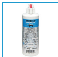
70090-L (4 oz - 118 ml)