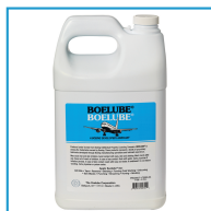
70090-04 (1 gal - 3.8 l)